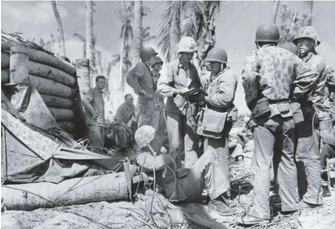
Betio, Tarawa, 22 Nov 1943, 2nd MarDiv - Col. Evans Carlson (seated), 8 th Marines; Col David Shoup, 2nd Marines; Col. Merrit Edson 6th Marines; Maj. Chas. McCoy (Tanks)