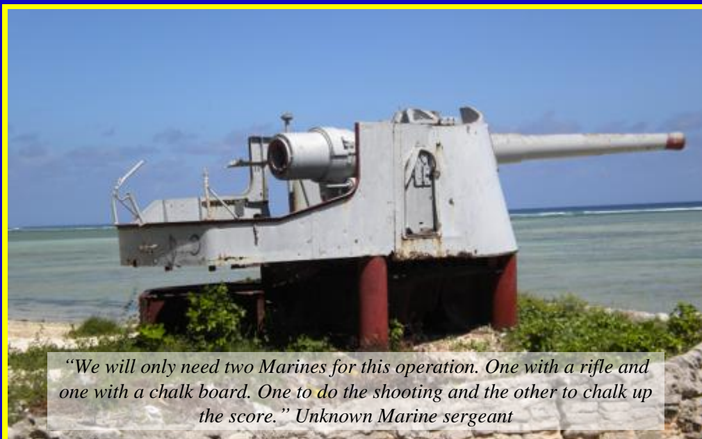
“We will only need two Marines for this operation. One with a rifle and one with a chalk board. One to do the shooting and the other to chalk up the score.” Unknown Marine sergeant