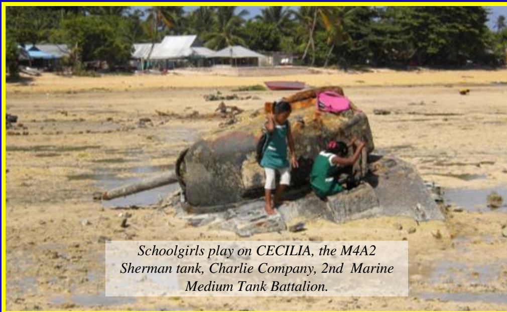
Schoolgirls play on CECILIA, the M4A2 Sherman tank, Charlie Company, 2nd Marine Medium Tank Battalion.

TARAWA 81ST ANNIVERSARY 26 JULY TO 2 AUGUST 2024